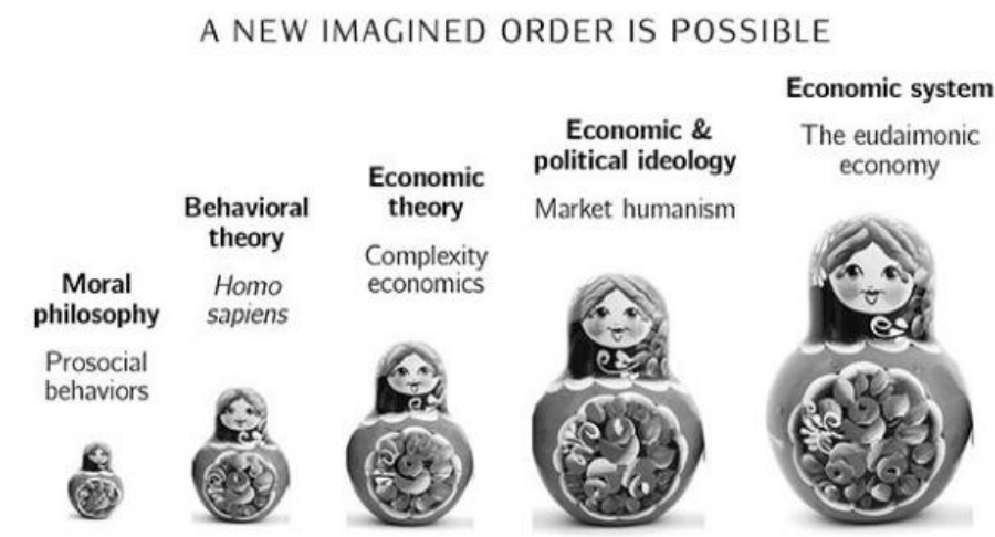
Figure 2. Beinhocker's suggested economic order [36]

SFI's perspective is an optimist one; however, in the spectrum of course, there are some scholars who are "less optimists". As we mentioned in the previous section, SFI had become more genial in recent years towards orthodox economics. According to the latest workshop that they held in 2019, there is a consensus that complexity economics is vital to solving current and future problems in and relevant to economy, and that the economists need to leave traditional approaches [37]. However, a "less optimist" SFI researcher Scott Page debates that equilibrium-based neoclassical economics and non-equilibrium-based complexity economics needs to be studied in a more complementary manner, rather than competing to be the dominant framework [38]. Grabner et al, [39] also provide a preliminary study to show how equilibrium-based models and agent-based simulation (nonequilibrium-based model) approaches together can give rise to insightful results. Their work tests their claims on the Kuznets hypothesis (long-run relationship between economic development and unemployment).